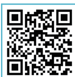
APIC 2024 Website